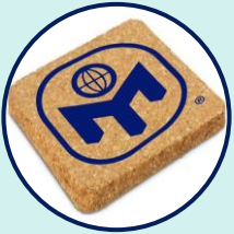
Coasters $7.95 for 4