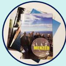
Menzed Print Subscription $20 per year