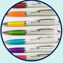
Vistro Pens $3 each