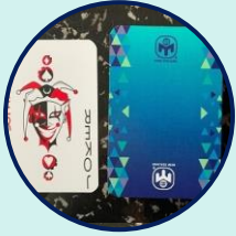
Playing Cards $7.50