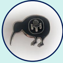
Kiwi Lapel Badge $10