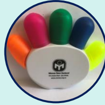
"Hand"y Hi-Liter $7.50