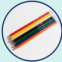
Pencils $2 each